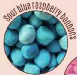
Sour blue raspberry bonbons